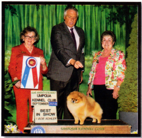
Best in Show (All Breed) win