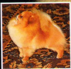
Jet Li, a.k.a. BISA BISS Am Gr Ph It Ch Canton Jet Li, is the 2013 APC Best of Breed.