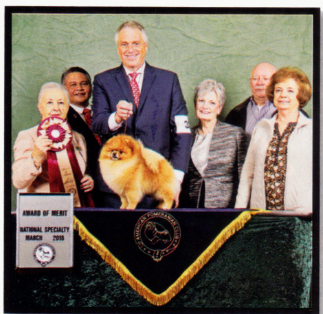
Award of Merit at the 2018 APC Nationals in Louisville