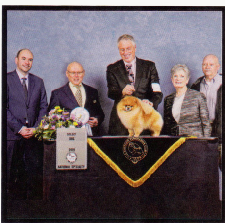
Select Dog at the 2019 APC Nationals in Louisville