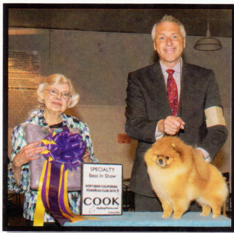
Best in Show (Specialty) win