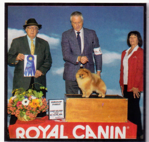
Group 1 win