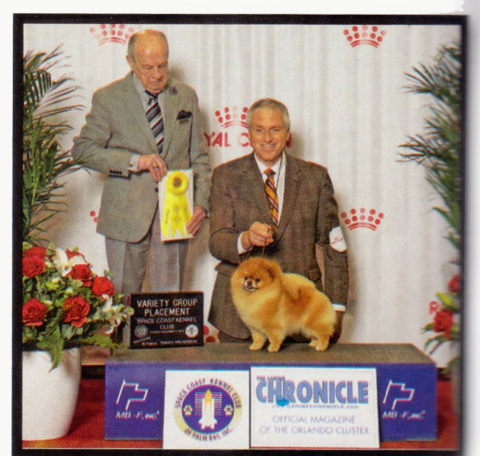
Best of Breed at the 2018 Orlando Show by Royal Canin